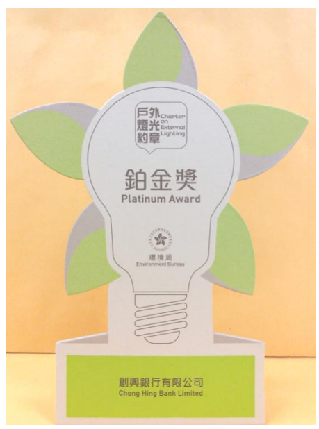
Chong Hing Bank receives the Charter on External Lighting-Platinum Award for the third consecutive year.